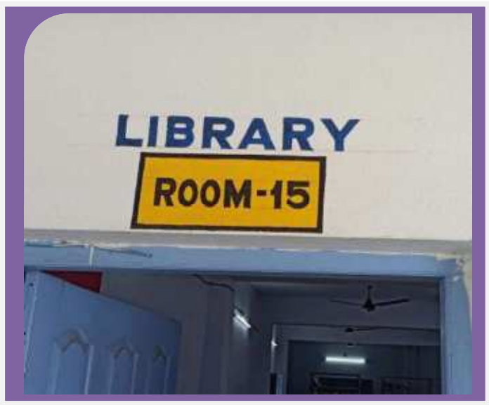
Fig. 2. Library entrance