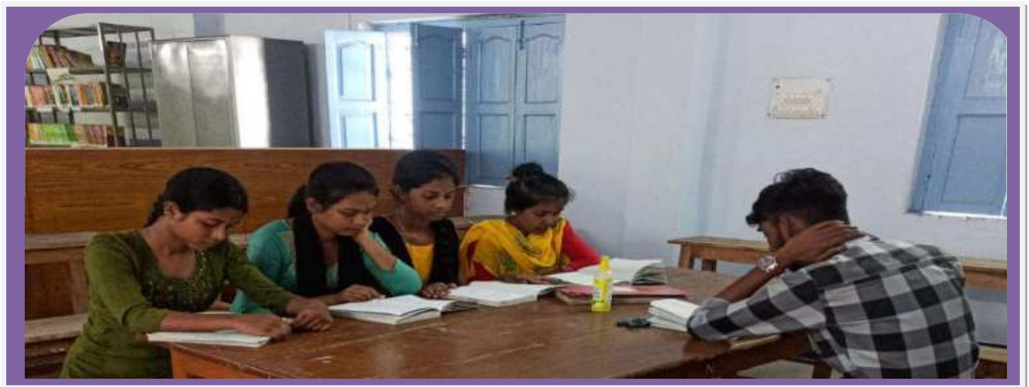
Fig. 5. Reading room facility for students