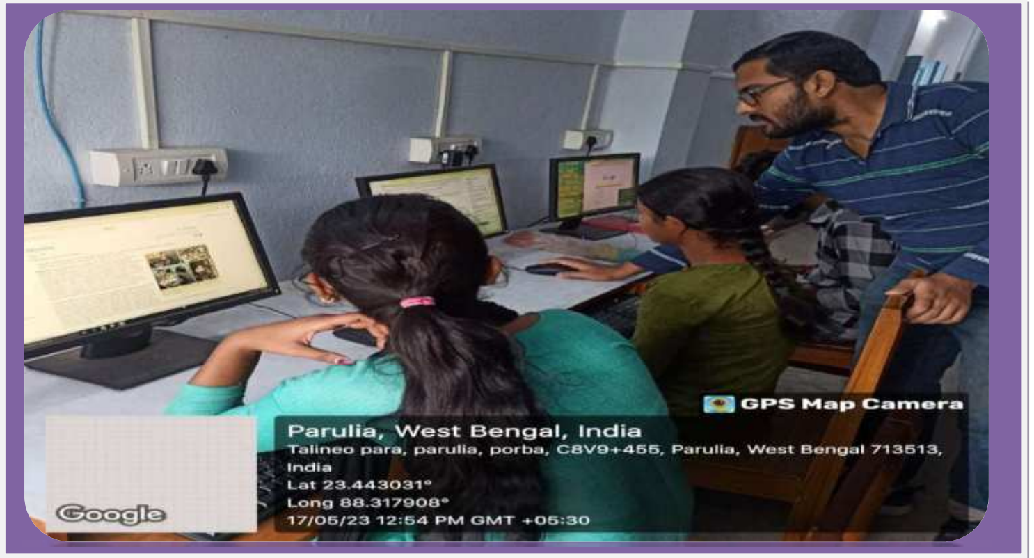
Fig. 6. Library computer facilities