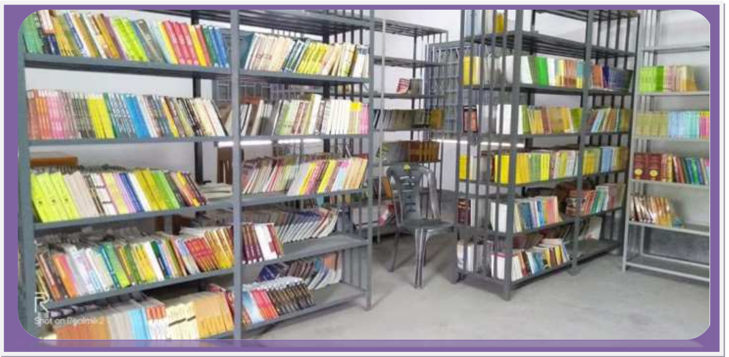
Fig. 1. Stacks