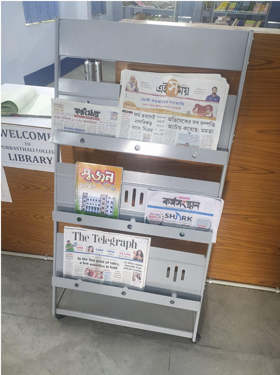
Fig. 12. Newspaper section