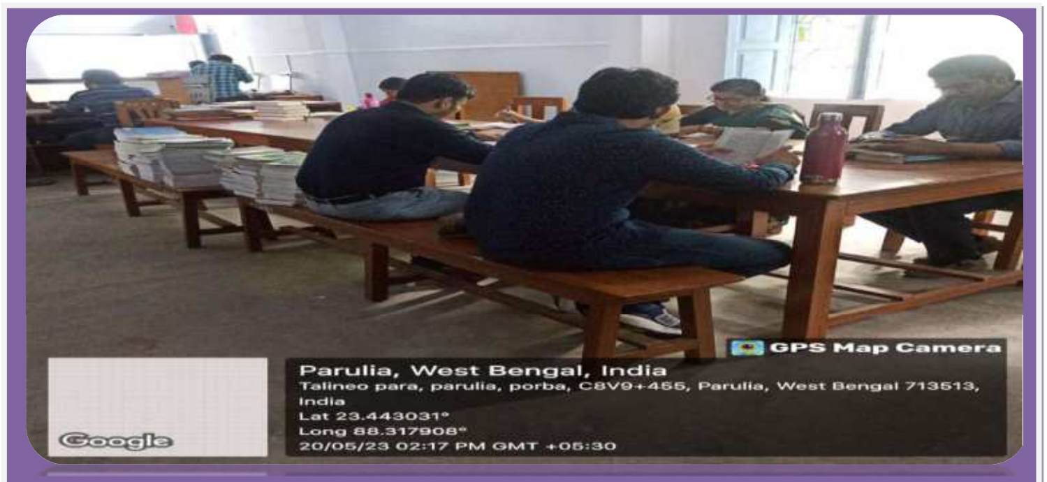
Fig. 4. Reading room facility for faculty members