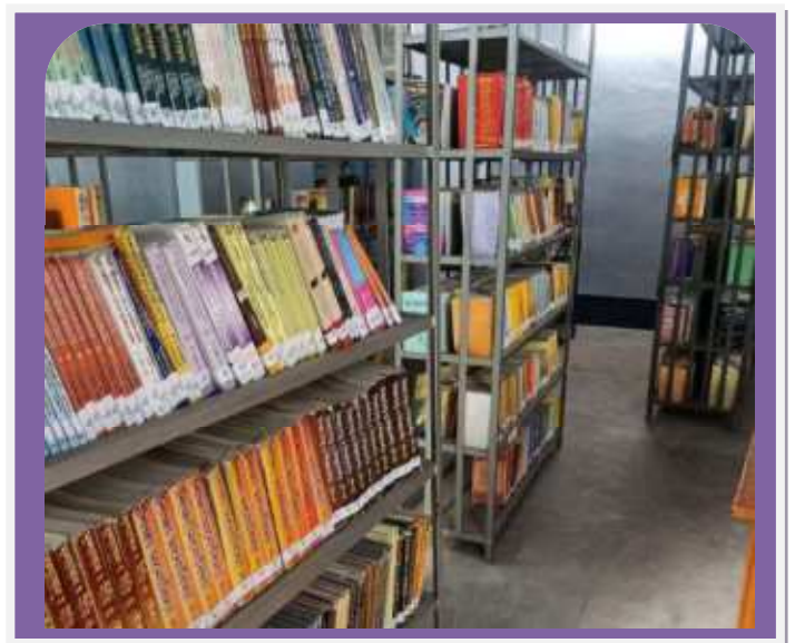
Fig. 3. Stacks